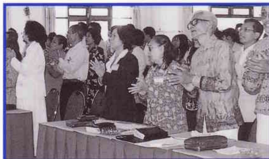
150 delegates at the Indonesian Seminar