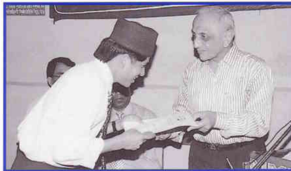
Receiving a diploma from South Asia Co-ordinator